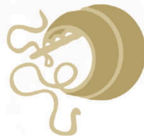
University of Florence Center for Cyber Security and International Relation Studies